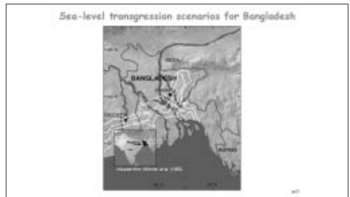
Figure 1. Land affected in Bangladesh by various amounts (in metres) of sea level rise. About 10 million people live below the 1m contour.

Talking in terms of changes of global average temperature, however, tells us rather little about the impacts on human communities. There will be some positive impacts, for instance a longer growing season at high latitudes. But most impacts will be adverse 3 . One obvious impact will be due to the rise in sea level (of about half a metre a century, equivalent to 20 inches) that is mainly occurring because ocean water expands as it is heated. This rise will continue for many centuries – to warm the deep oceans as well as the surface waters takes a long time. This will cause large problems for human communities living in low-lying regions. Many areas, for instance in Bangladesh (Figure 1), southern China, islands in the Indian and Pacific oceans and similar places elsewhere in the world, will be impossible to protect and many millions will be displaced.